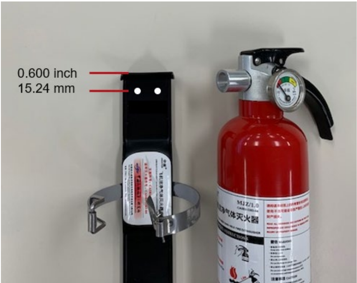
Figure 1. Floor and door post mounted bracket attaching screw hole location.