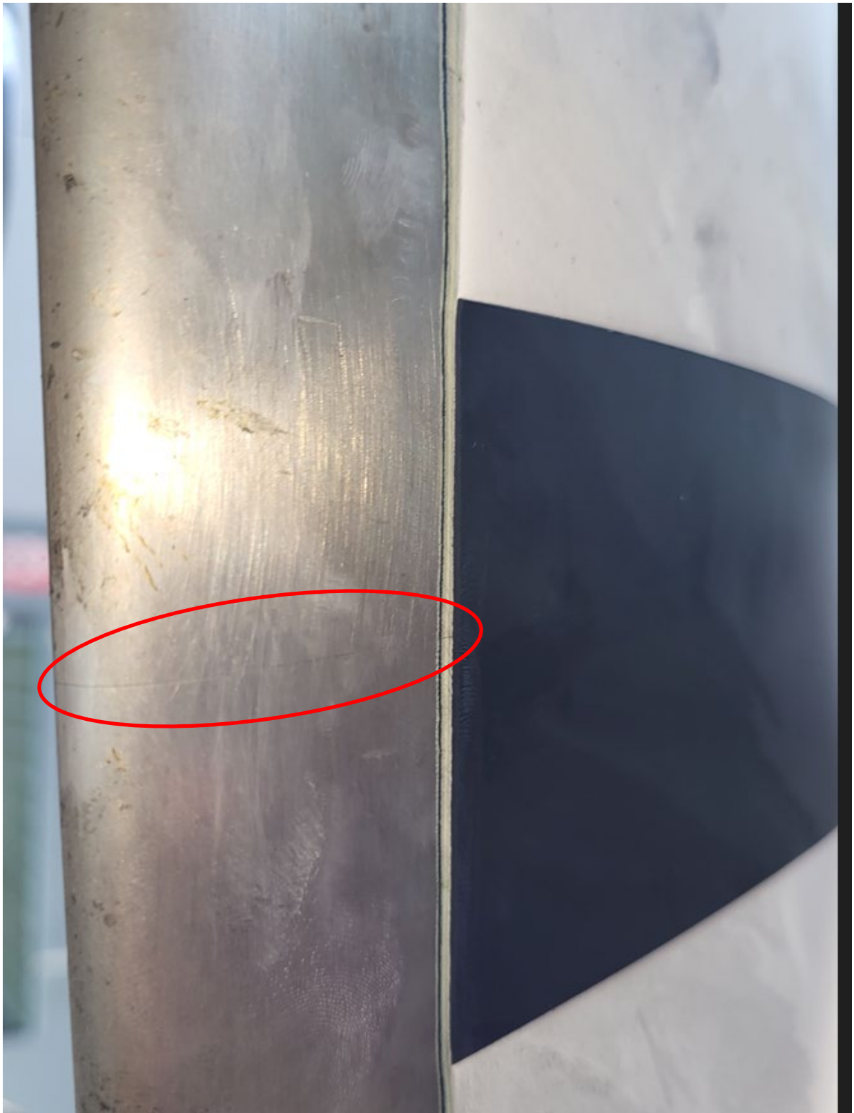
Figure 2 - Example of a Typical Abrasion Strip Crack