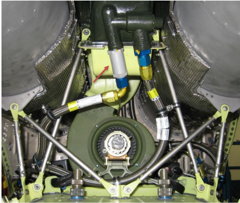
Transmission oil check valve and location Detail A