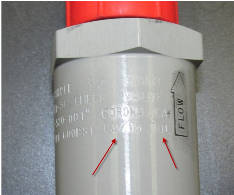
Circor Aerospace Oil Check Valve Marked "TQL" Detail B