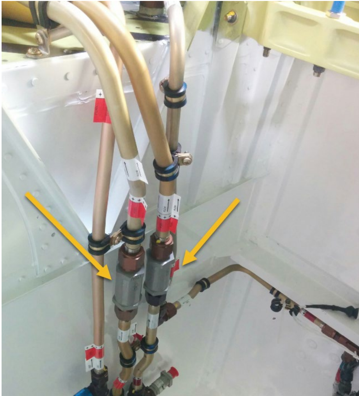
Figure 1. Fuel Check Valves Location