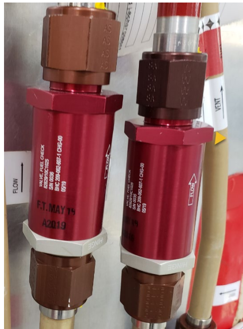
Detail B. Fuel Check Valves not Manufactured by Circor Aerospace