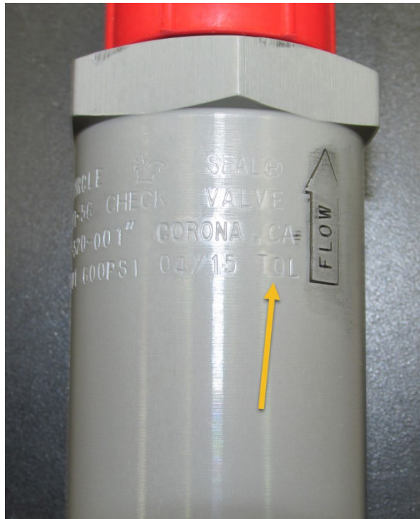
Detail A. Circor Aerospace Fuel Check Valve Marked "TQL"