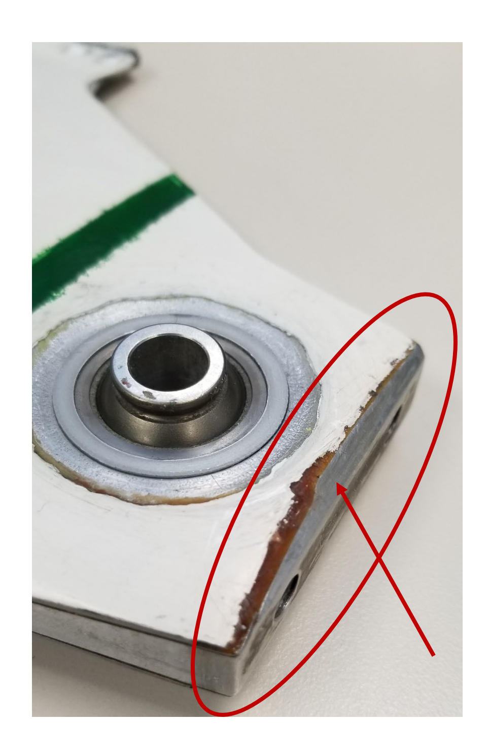
FIGURE 3 – Example of Tail Rotor Blade Root End Tapered Aluminum Butt Block

ASB 206L-19-182 Page 5 of 5 Approved for public release.