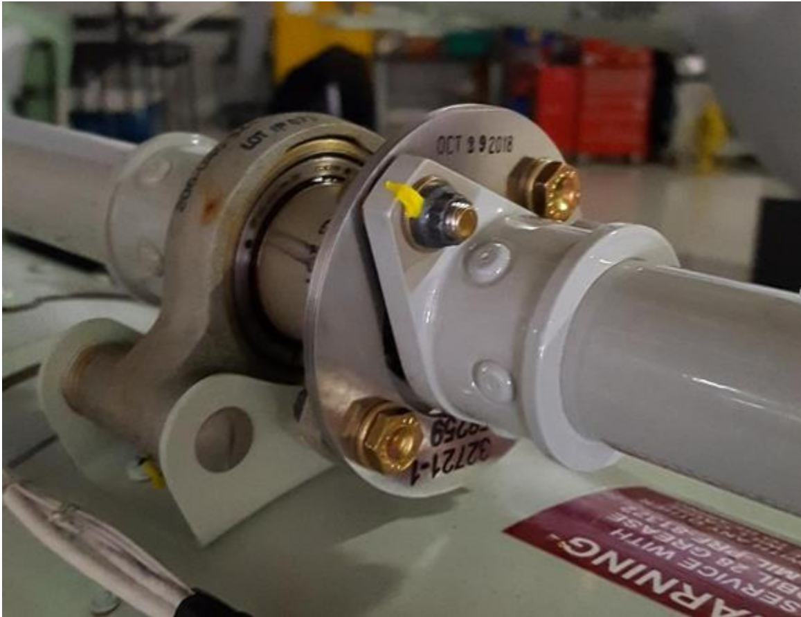
Figure 2 - Application of Torque Seal Lacquer (witness mark) (Shown as a yellow stripe from the nut to the adapter flange)