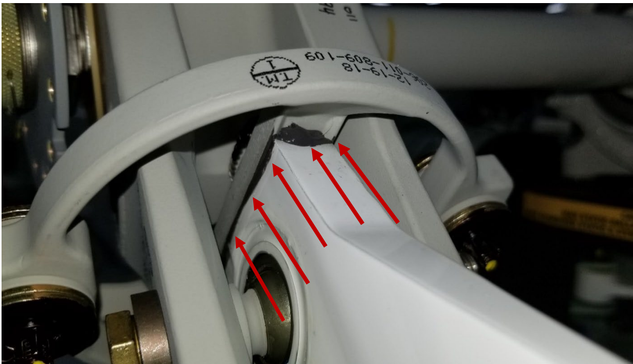
FIGURE 2 - Tail Rotor Blade Root End with Sealant Applied