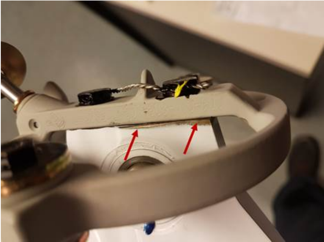
FIGURE 1 - Tail Rotor Blade Root End without Sealant