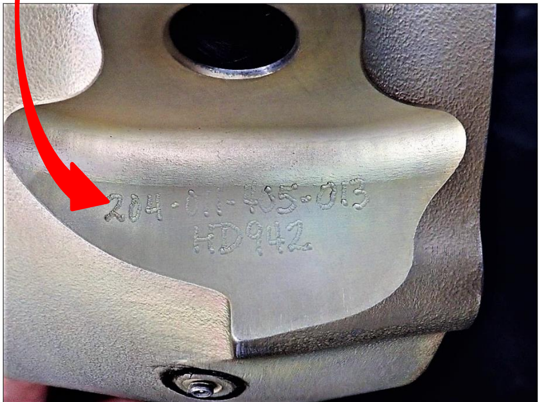
Figure 2 – Vibro-Etched Part Number and Serial Number Location

ASB 205B-21-73 Page 7 of 7 Approved for public release.