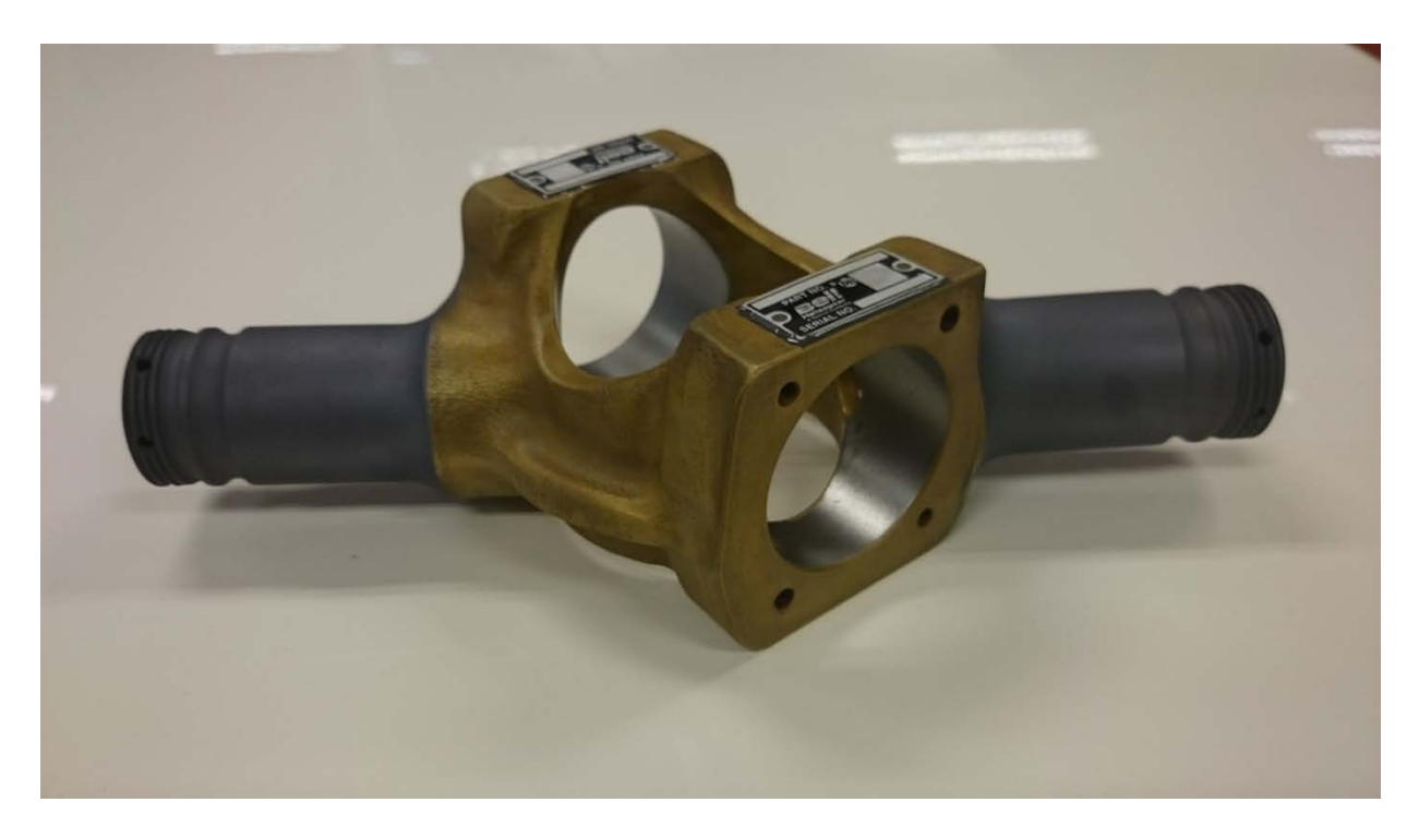
Figure 2. Conversion Coating Application Areas

ASB 204B-16-71 Page 6 of 6 Approved for public release.