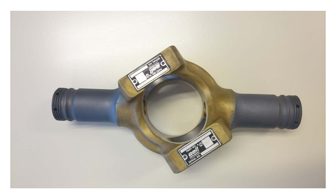
Figure 1. Conversion Coating Application Areas