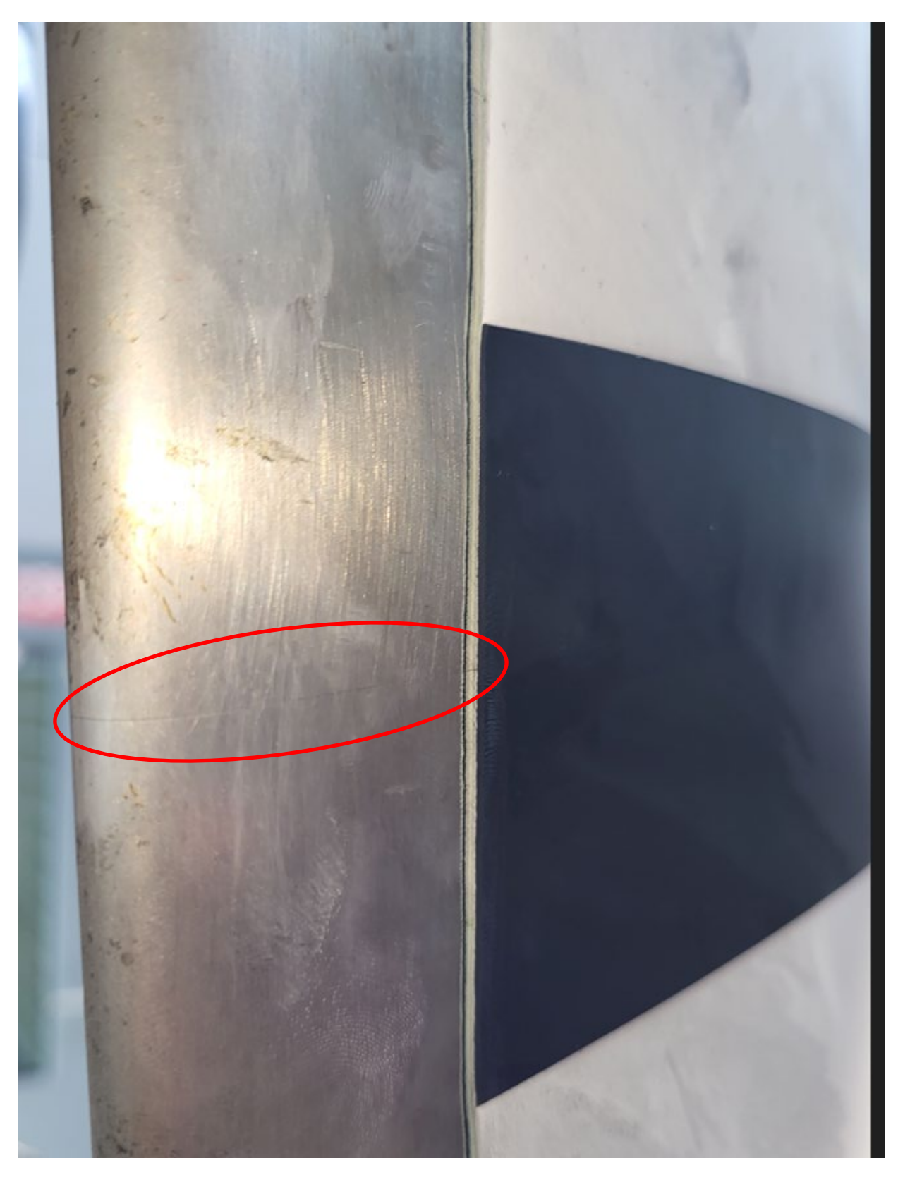
Figure 2 - Example of a Typical Abrasion Strip Crack

ASB 429-24-63-RB Page 8 of 8 Approved for public release.